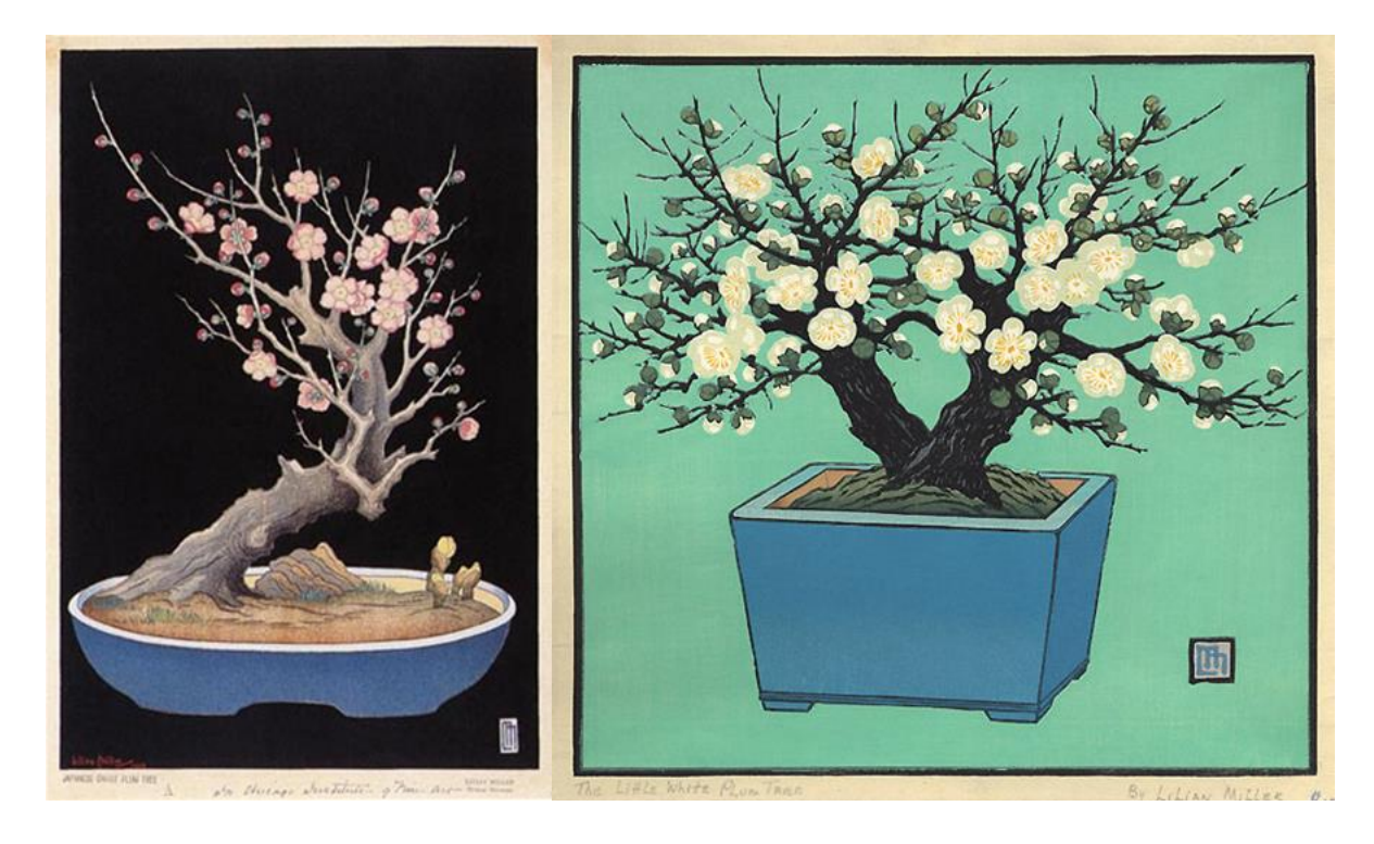
Japanese Dwarf Plum Tree A (1928)