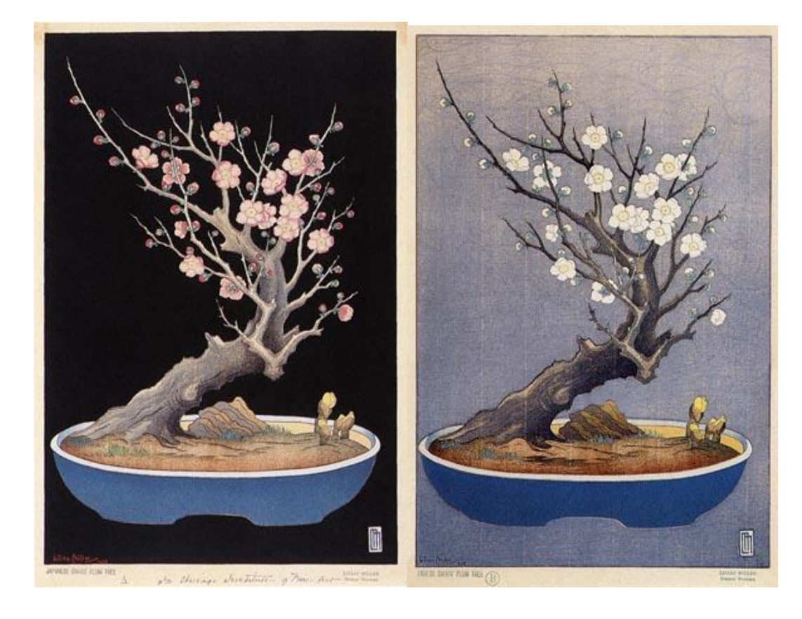
Japanese Dwarf Plum Tree A (1928)