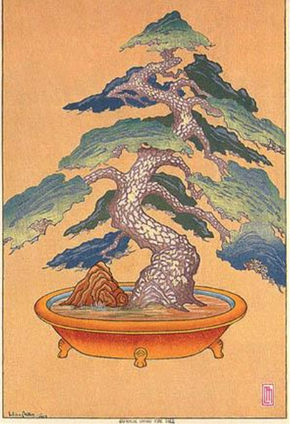
Japanese Dwarf Pine Tree A (1928)