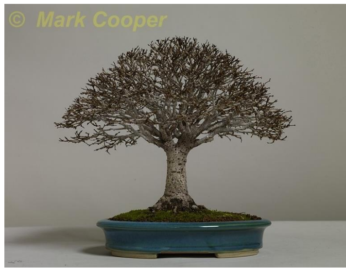
Zelkova in leaf and without so you can see the broom branching structure.