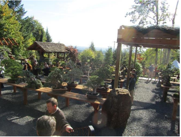
View from Ryan's house which has a great view of Mt. Hood. His 3 story studio is the building you see.