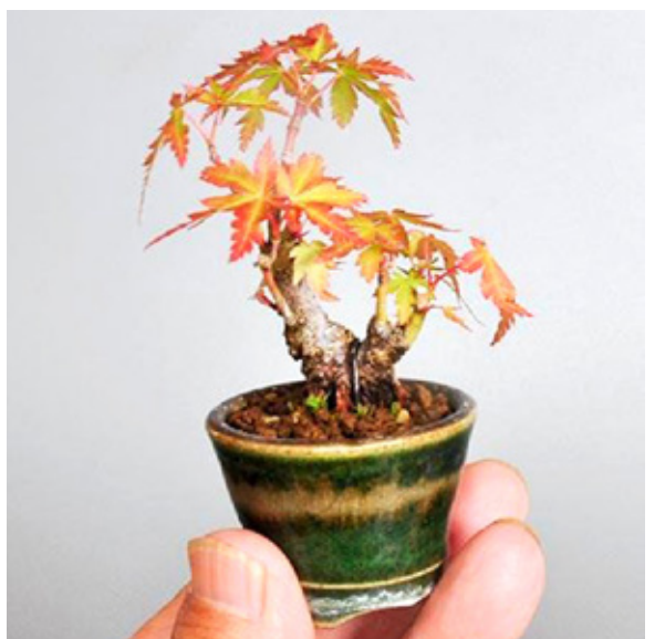
The sweet little Japanese maple belongs to Hiroshi Kunii. Hiroshi calls the pot Maru (circle in Japanese).