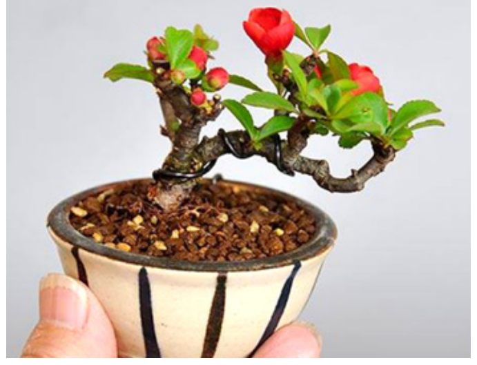
An old tree with significant deadwood

Bonsai vary from trees so large I cannot pick them up alone to trees so small my clumsy fingers can have trouble safely holding them. Here are some small trees, including flowering trees, in some quite lovely little bonsai pots that definitely add to the image.