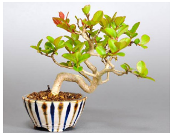
Here is fun, flowing Crape myrtle i (Lagerstroemia Indica) n a fun little pot.