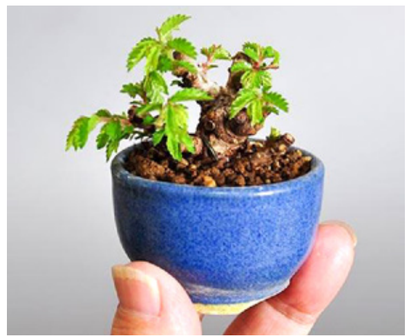
Zelkova (Ulmus parvifolia) in an attention grabbing blue pot. I have some nice shohin Zelkova, but this ais really small. My watering skills would likely be inadequate to keep a tree like this.