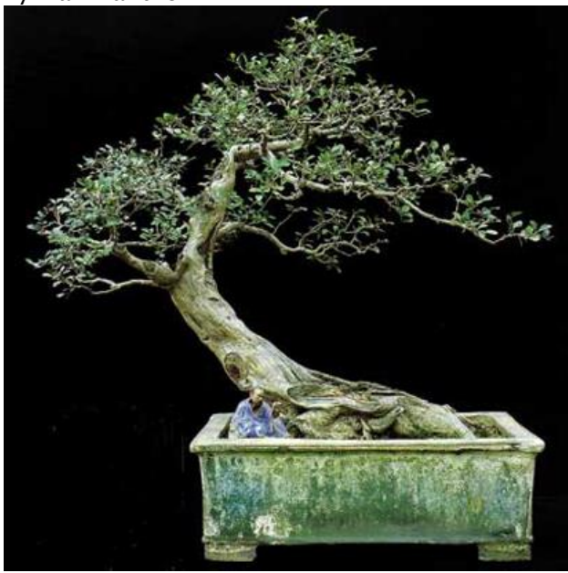
Classic penjing in antique pot with scholar figurine

Penjing. Chinese bonsai. Or so it is simplistically often described. Actually, penjing is a rich historical botanical art form of many schools and types that in its earlier history was the parent of bonsai and which has continued to evolve into a strikingly different art genre than bonsai and yet so clearly shows its family relationship with bonsai. [Like siblings and cousins at a family reunion—as you look around you begin to see so many shared features.] Like bonsai, which was so Japanese in its essence but is now studied and enjoyed around the world, penjing, so thoroughly Chinese, is now enjoying an increasing audience and serious study around the world.