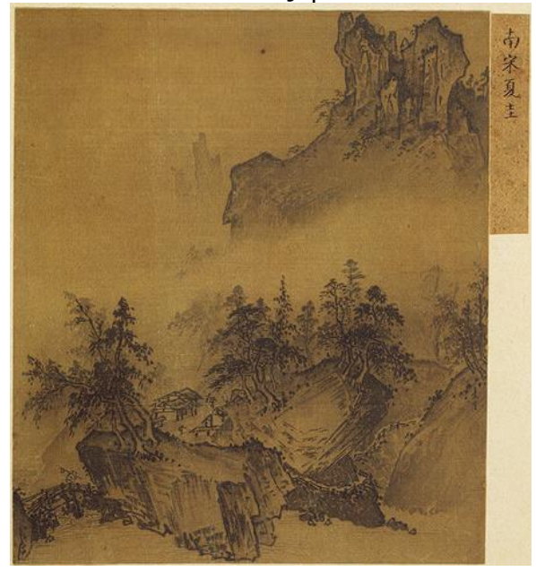
Mountain Market in Clearing Mist, signed Xia Gui (active ca. 1195–1230) Southern Song Dynasty (1127–1279) Album leaf; ink on silk.

For now, I will simply note that the Chinese Southern Sung pictorial style (1127–1279) was contemporaneously appreciated by the Japanese court, and therefore the Japanese social hierarchy. Consequently the great majority of Southern Sung paintings surviving in the modern world are in Japan, not China or anywhere else to which foreign imperialists took their ill–gotten booty. The Southern Sung scroll paintings more than any other Chinese or Japanese painting style portraits the paradigm image of misty mountains clothed in conifers with meaning imbedded in the nothingness of high elevation nature. The imagery plucked a cord in the Japanese soul. It was absorbed and remained at the core of Japanese aesthetics.