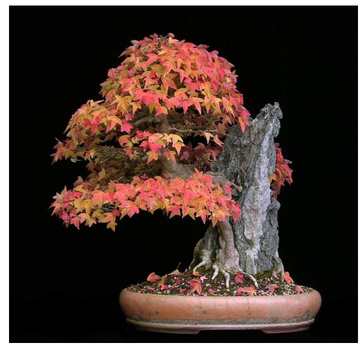
Trident maple in root over rock style by Wolfgang Putz.