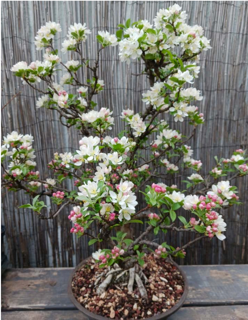
Bill Englert's 28 years old crabapple pulls out all the stops and puts on a great spring show!