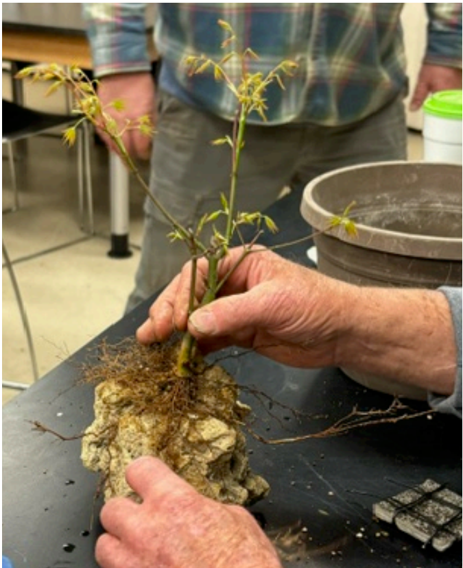
Top left, the roots of the cutting-grown Japanese maple are well-developed and healthy. Above, the roots after the tap-root is removed. At left, the maple positioned on the rock.