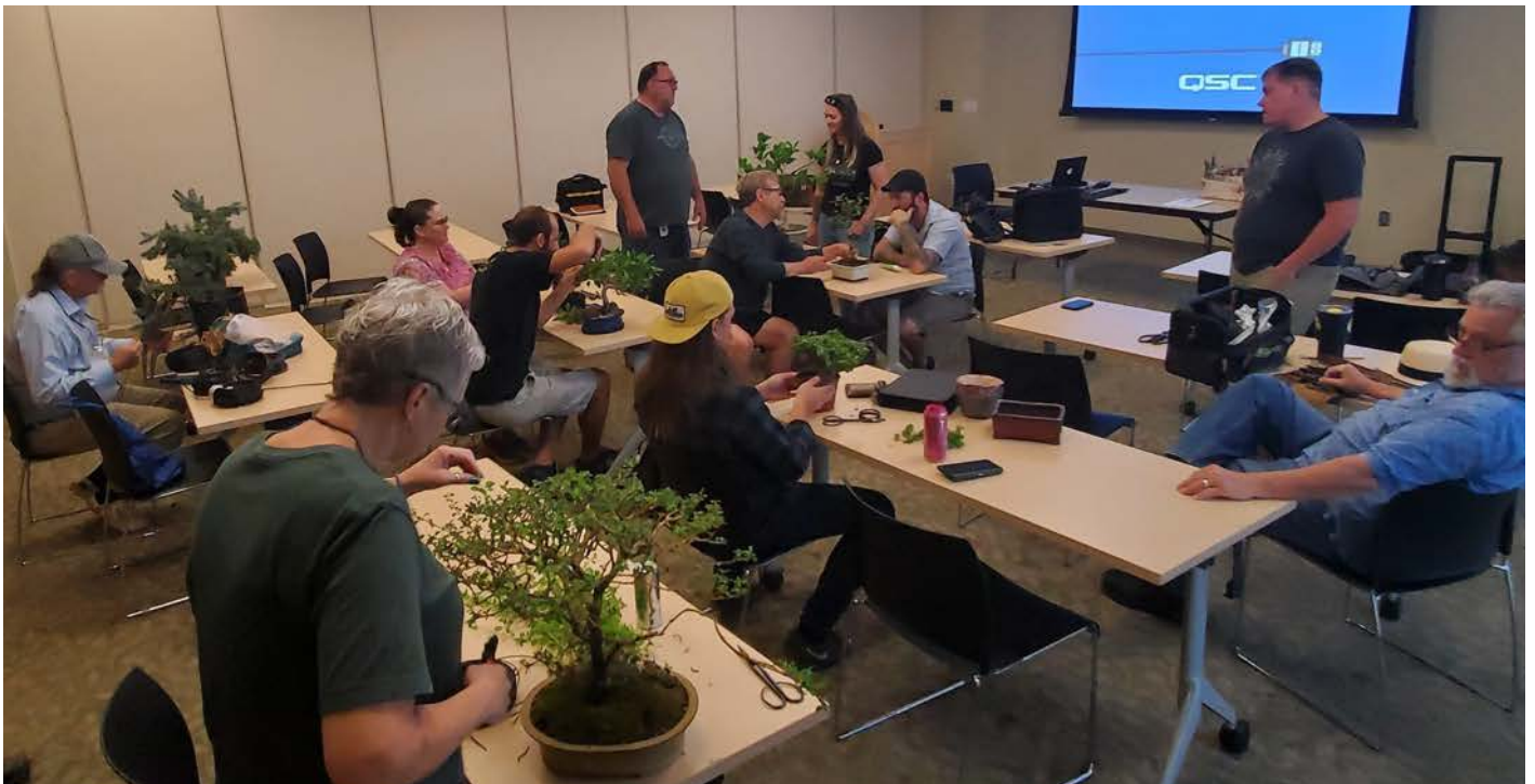
IBA Members work on trees during the September meeting, September 16, 2023, at the Greater Des Moines Botanical Garden.

October's IBA meeting, open study will be held October 21, 2023, at the Greater Des Moines Botanical Garden, in the Kemin Lab 9am, the topic of discussion will be Watering/Winter watering. hope to see you all there and don't forget to check out the clubs Facebook page.