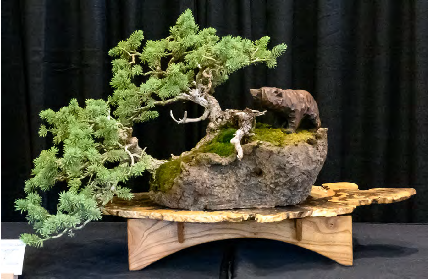
Above, Bob West's Colorado Blue Spruce. Pot - Custom design from Dasu Bonsai.

The 2023 Reiman Garden Exhibition was held September 30 and October 1, 2023. This is a weekend dedicated to education of the public. There were 47 trees displayed, of many different styles and species. There was a table dedicated to viewing stones and another table dedicated to kusamono. Club members gave demonstrations throughout the day on Saturday. On Sunday, Cat Nelson brought a large tropical to work on through the course of the day. This always generates lots of questions and Cat is very good at answering those.