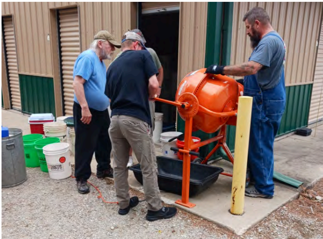
EIBA Members got together at the EIBA storage unit in Swisher, IA, on September 24, 2023, to mix club soil.