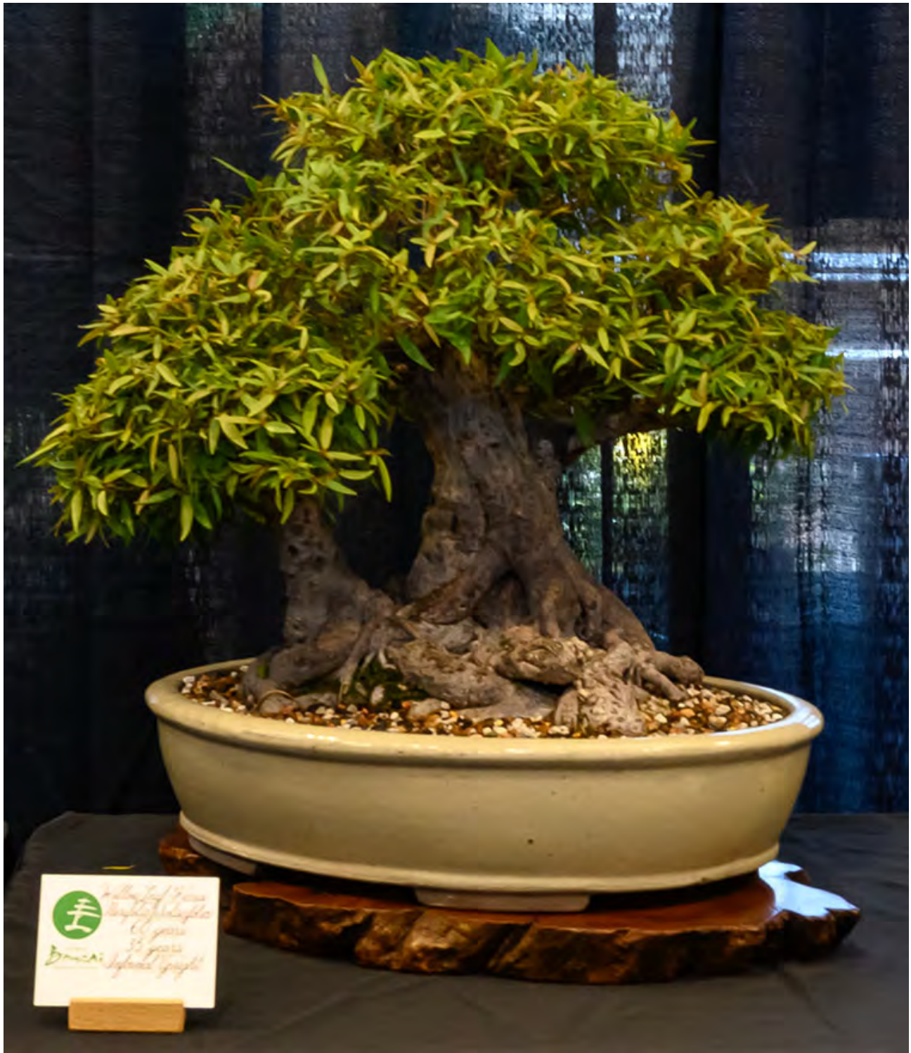
Dan Morton's Willow-leaf Ficus ( Ficus salicaria ), with its incredible nebari.