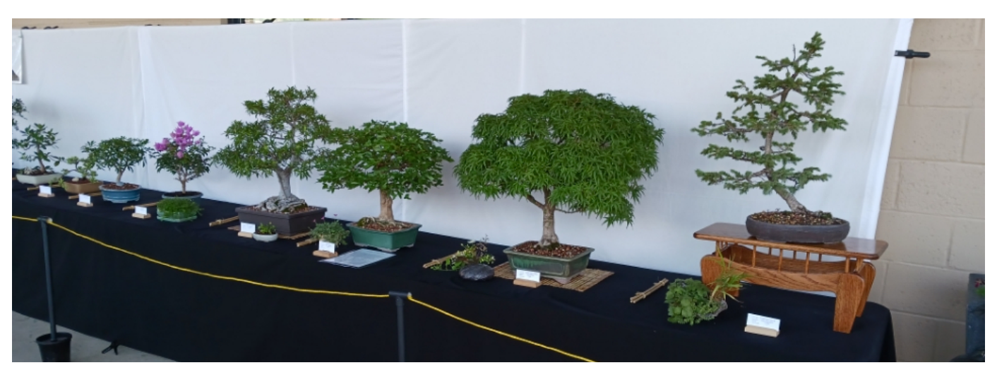
A portion of the display at EIBA's Newbo Exhibition on Saturday, August 19, 2023. See more pictures from EIBA Activities Next Page.