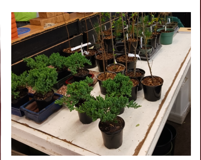
Left, Seedlings available to EIBA Members for purchase. Contact Bill Englert for more information.

Has LOTS of Tropicals, new dwarf conifers and 128 new companion plants - many varieties at good prices.