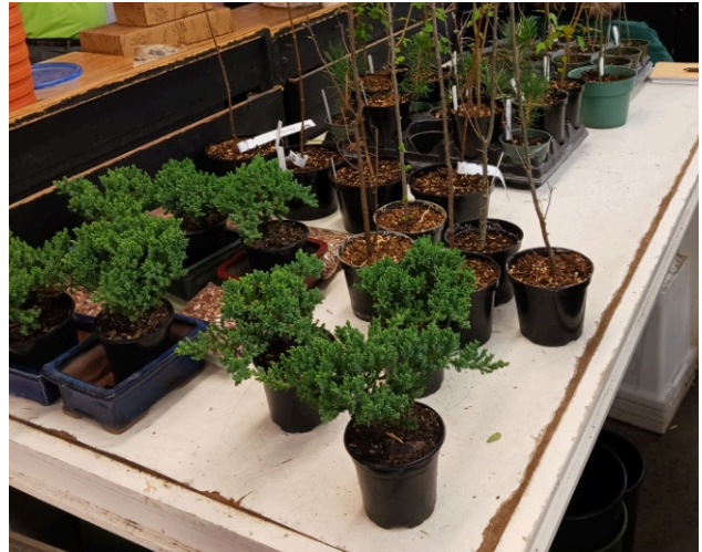
Left, Seedlings available to EIBA Members for purchase. Contact Bill Englert for more information.

FOR SALE: DaSu Studio, lowman@netins.net Has LOTS of Tropicals, new dwarf conifers and 128 new companion plants - many varieties