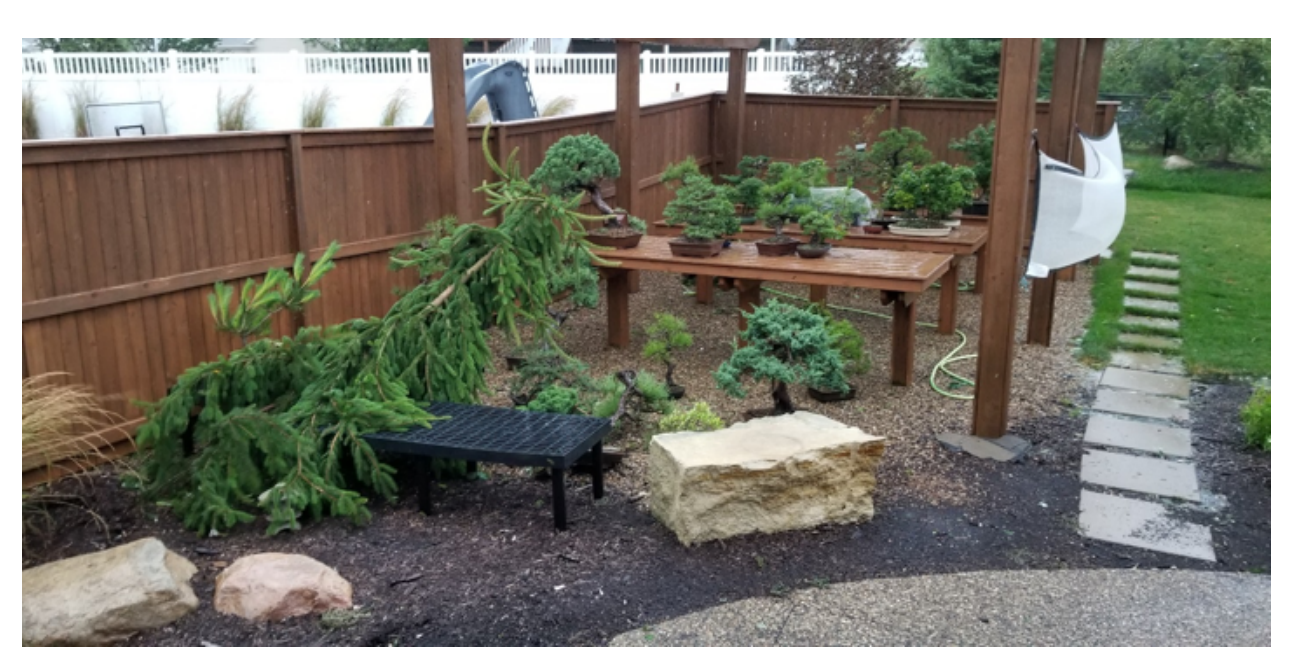
This is a photo after trees were set back upright and some trees placed back on tables.

I stood, drenched and dripping, as the storm raged on. More siding and shingles. A landscape tree pulled from the ground and landed square on a bonsai nursery table. It knocked a heavy trunked juniper off the table and onto the slanted Ponderosa, which I had carefully placed on the ground for its safety. Later I