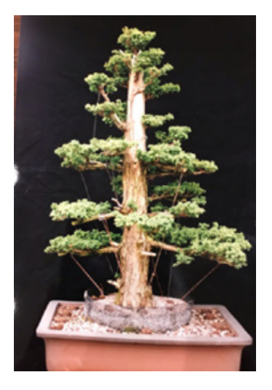
Rough styling done, and in a bonsai container.