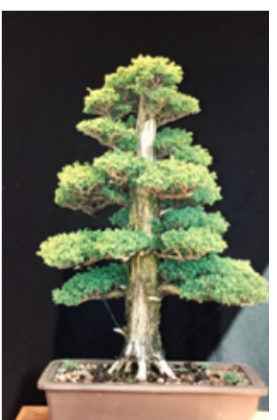
Further along in the development of the tree, the 'fingers' beginning to show in the branch work. And in another pot too. The tree is still in Boon's yard at this point.